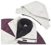
White / Maroon