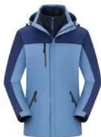
Light Blue / Navy