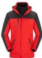
Red / Black